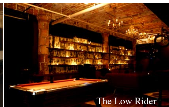
The Low Rider